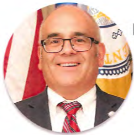
Reed Gusciora Mayor Trenton State of the City Broadcasts