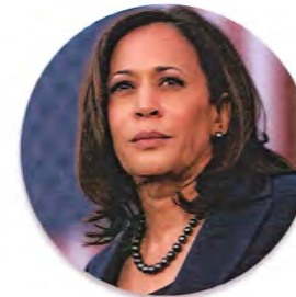
Kamala Harris Vice President United States Newark Lead Pipe Presentation