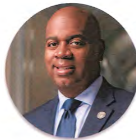
Ras Baraka Mayor Newark State of the City Broadcasts